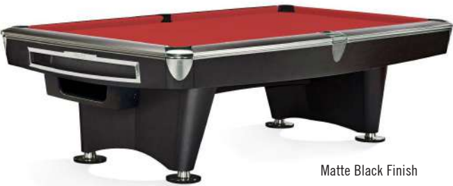
Matte Black Finish