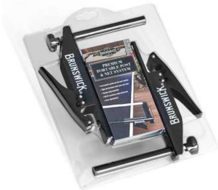
TABLE TENNIS PREMIUM NET & POST

Be ready to play anytime with performance-quality rackets and Brunswick balls with high control characteristics for consistent play and precision. Choose from a two- or four-player pack.