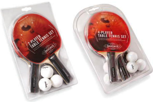
TABLE TENNIS PADDLE AND BALL SETS

Be ready to play anytime with performance-quality rackets and Brunswick balls with high control characteristics for consistent play and precision. Choose from a two- or four-player pack.