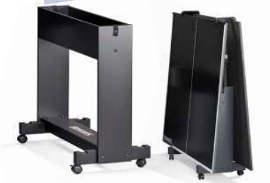
TABLE TENNIS CONVERSION TOP CADDY

Features a durable foam pad-backed top and measures 54" W x 92.3" L. Fits seven-foot Brunswick pool or air hockey tables and includes paddles, balls, and clip-on net.