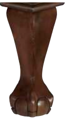
Ball and Claw