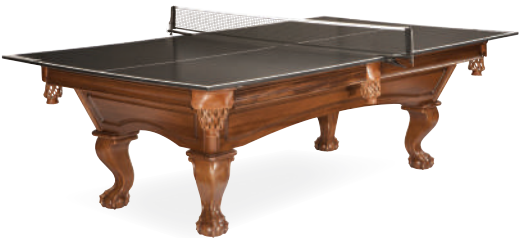
TABLE TENNIS CONVERSION TOPS

Our premium tournament-grade net and post system features high performance steel post and clips. The assembly is a simple snap and the net has easy adjustments. The premium cotton blend net measures 69.25".