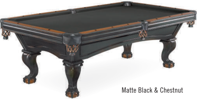
Matte Black & Chestnut