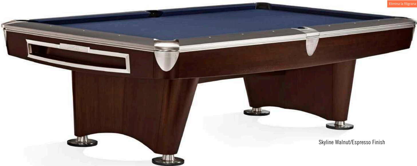
Skyline Walnut/Esspresso Finish

The Gold Crown VI continues Brunswick's tradition of excellence as the newest edition of the legendary table series. The Gold Crown VI features a familiar design with modern styling. The new, low-profile leg base and hidden stretcher provide a streamlined appearance while the angular canted leg emphasizes the clean lines. The table also features all new rail castings in a brushed nickel finish for a sleek, high-end aesthetic.